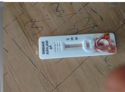
Positive malaria test

We are so grateful for the provision that has been available to build this health center. However, we realise that there is an ongoing cost which needs to be covered every month in order to make this center an effective resource for the whole community. Our monthly budget: